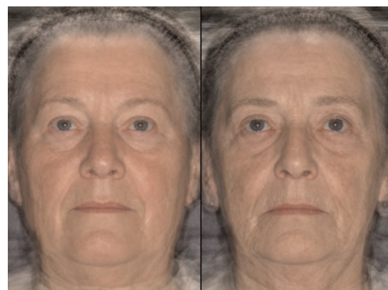
Fig 1 | Composite pictures each representing average appearance of groups of 10 twins aged 70 (range 69-71). Left hand image represents twins who looked younger for their age (average perceived age 64, range 57-69) than those represented by right hand image (average perceived age 74, range 70-78)

The assessment of physical functioning was based on an adaptation of an instrument developed and previously